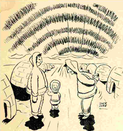
"My goodness, it seems like he's grown up overnight!"

M&M TOYS.. 17800 Chatsworth St. .EM 3-5412